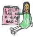
Excellent Reading Dalia – Pebbles Class