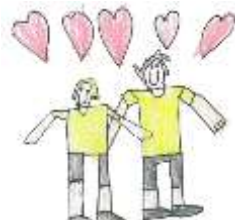
Amazing Relationships Amber – Pebbles Class