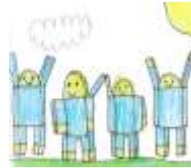
Simcha (Shared Joy) Pebbles Class