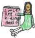
Excellent Reading Percy – Pearls Class