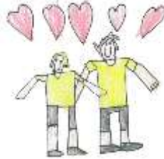
Amazing Relationships Preston – Puffins Class