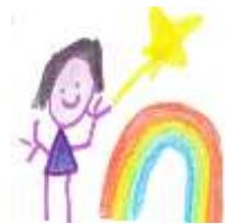
St Alphege Values Daisy – Seagulls Class